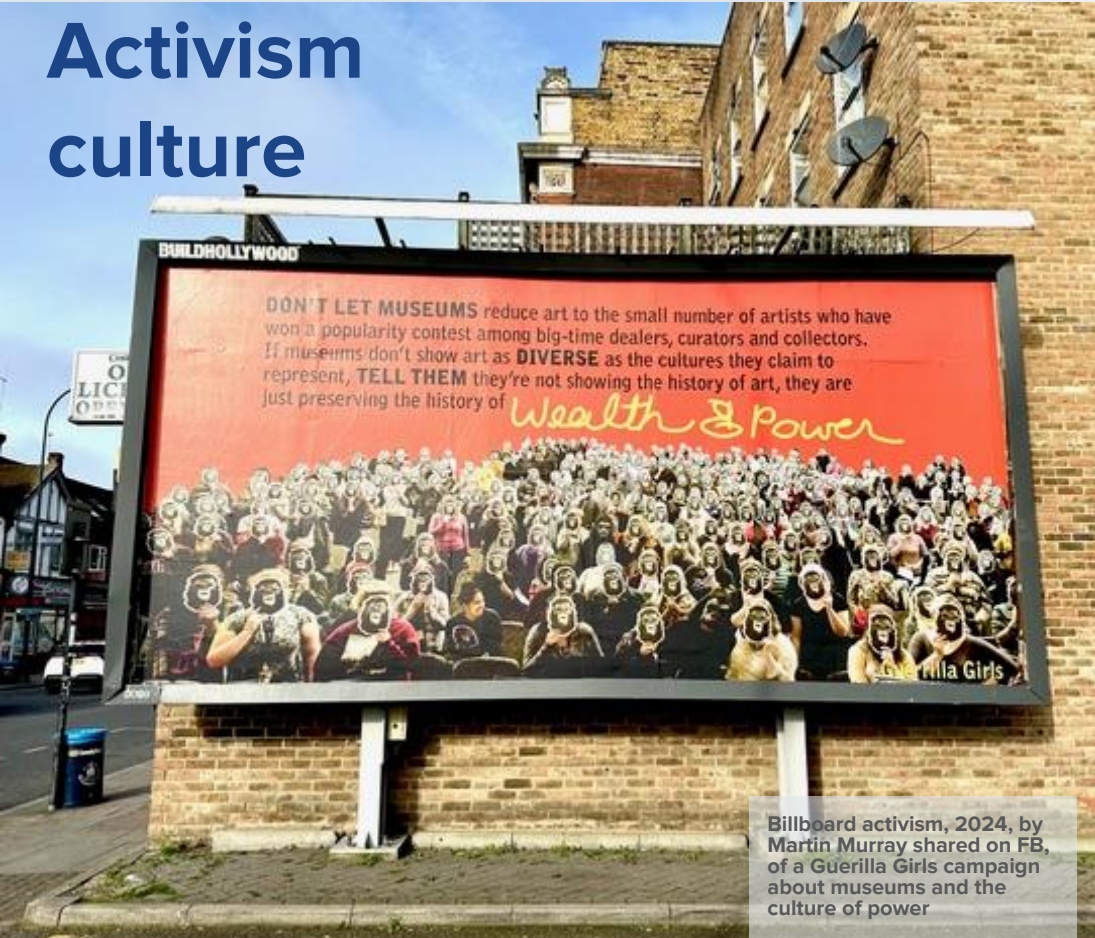
Billboard activism, 2024, by Martin Murray shared on FB, of a Guerilla Girls campaign about museums and the culture of power

Capturing socio-political citizen activism of places