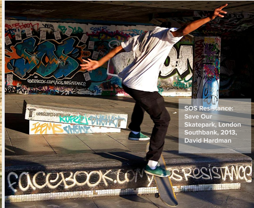
SOS Resistance: Save Our Skatepark, London Southbank, 2013