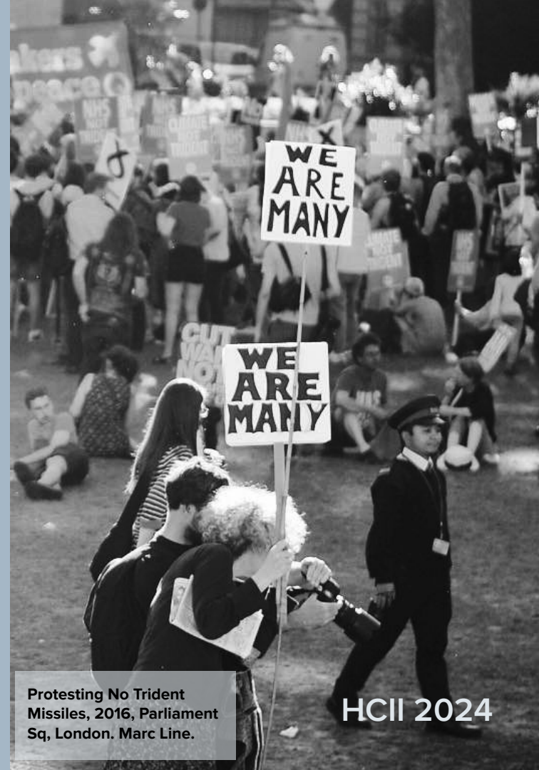
Protesting No Trident Missiles, 2016, Parliament Sq, London.