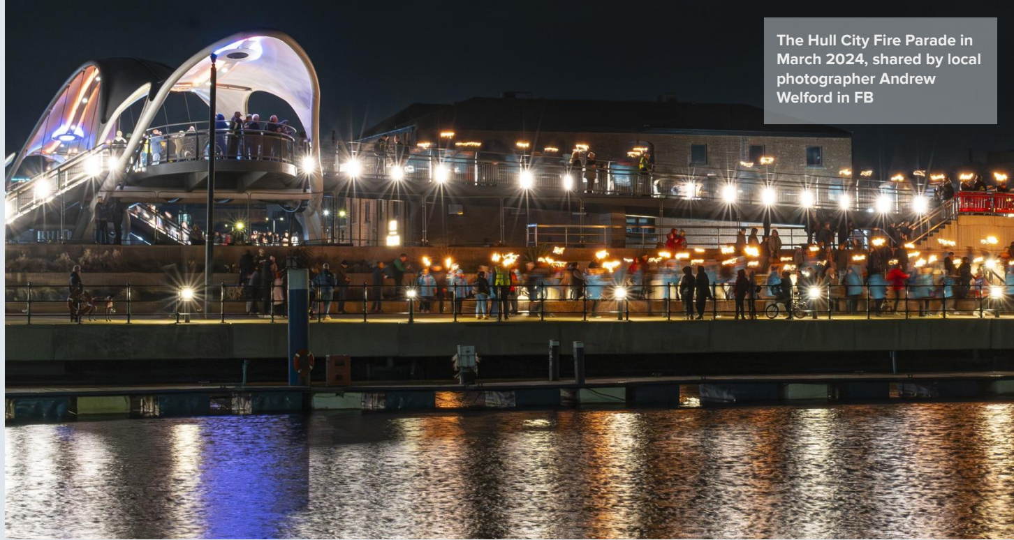
The Hull City Fire Parade in March 2024

Civic pride in citizen events, shared and celebrated. A community togethering